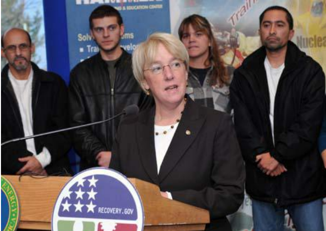
Figure 1 - “Great work is being done by the workers here, who come to work every day at Hanford to help shrink the cleanup footprint and perform critical work for our country is so appreciated by everyone of us. Every time I’m here and I see new workers being trained, I know they are going to go out and perform critical jobs to clean up Hanford safely.” US Senator Patty Murray, during a visit to HAMMER on November 12, 2009 to observe Recovery Act training and provide a media update on the success of the Recovery Act