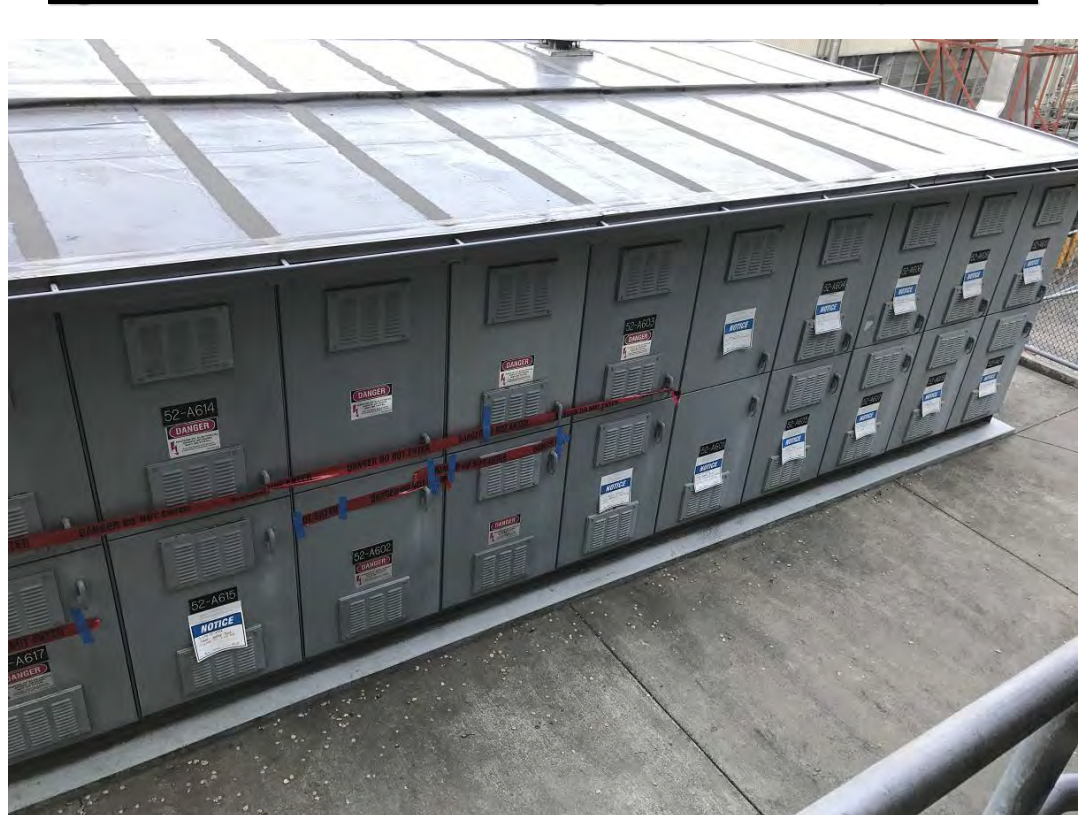
Figure 7D – Substation view once all signs and barricade tape installed