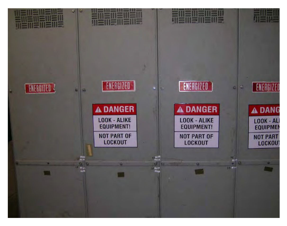
Figure 8E - Magnetic Signs Installed

Example of a magnetic sign warning that the Look-Alike equipment is not part of an established Lockout.