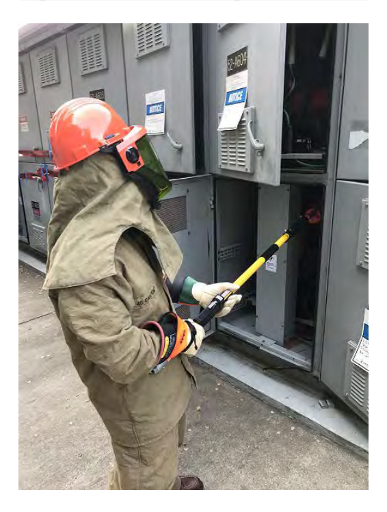
Figure 8A - Magnetic Signs used on energized cubicles