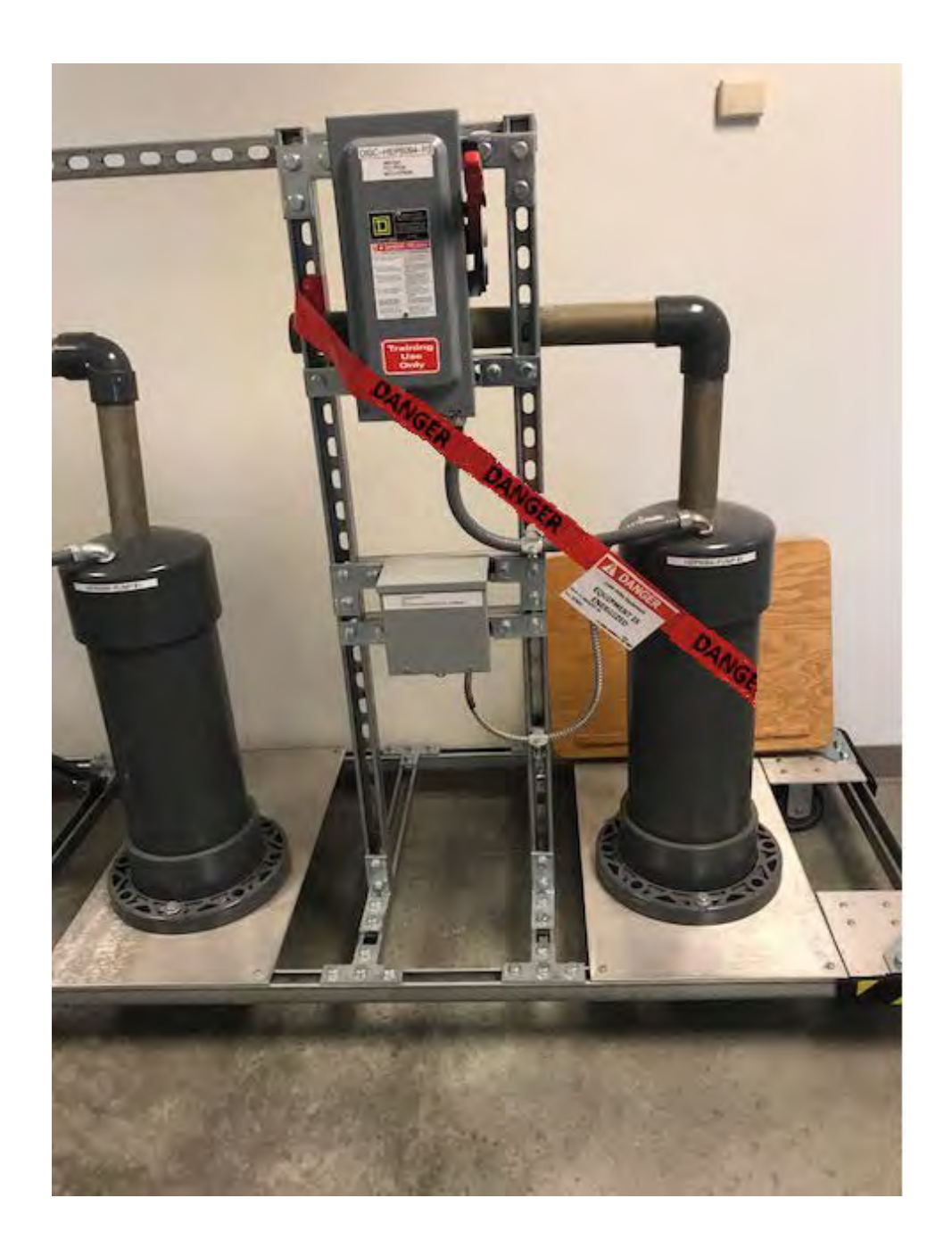
Figure 4B - Energized Equipment Marking

Addition of barricade tape to provide enhanced warning of energized look-alike equipment