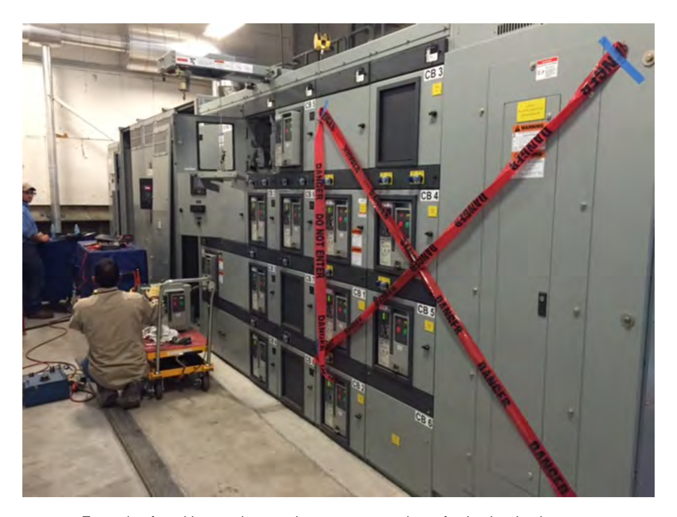
Figure 5A - Unit Substation during Maintenance, Front

Example of marking sections workers are to stay clear of using barricade tape