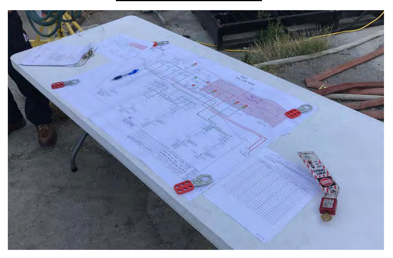
<u>Figure 7A – One line drawing delineating LOTO isolations, grounding device locations</u> <u>and work scope located at work site</u>

A centralized point close to the work should be established to perform pre-job briefings and serve as a common point where questions or concerns about the work can be addressed. One line drawings of the equipment must be available and printed large enough to follow the scope of work and verify lockout points before the work starts and as the work progresses. Each worker may also be provided with a smaller one line drawing for quick reference as needed.