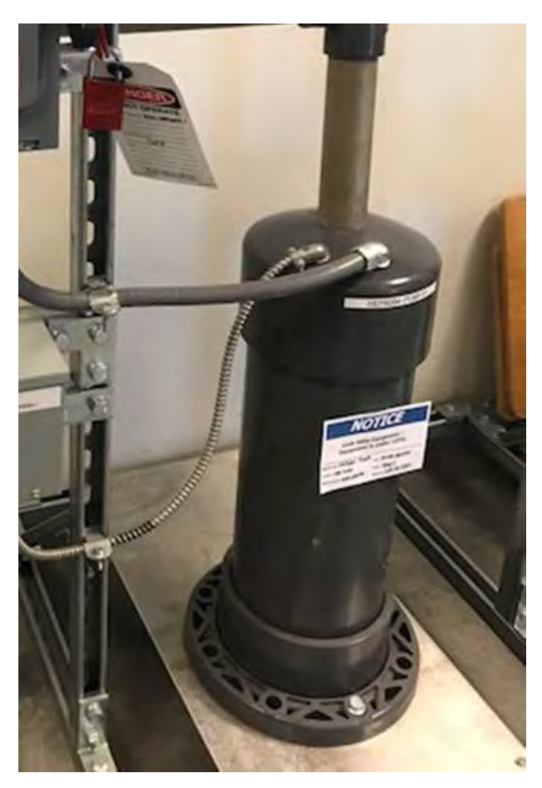
Figure 4C – Equipment to be Worked On

Notice sign on unit to be accessed, indicating LOTO and Work Authorization documents needed