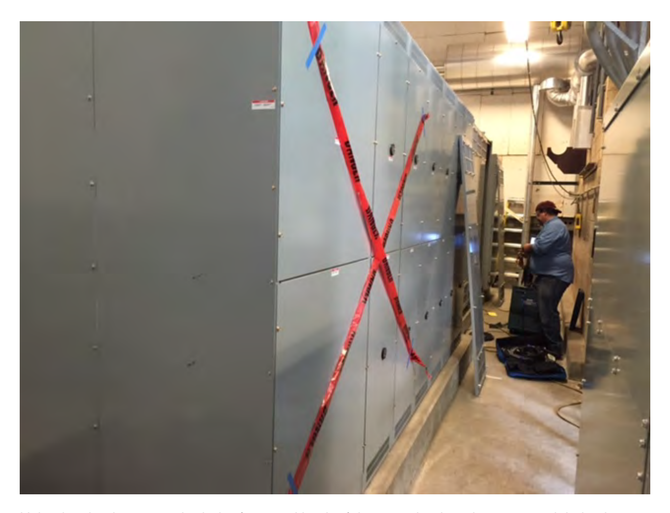
Figure 5B - Unit Substation during Maintenance, Rear

Using barricade tape on both the front and back of the energized equipment, to minimize human error when counting cubicles or when equipment identification is not prominent.