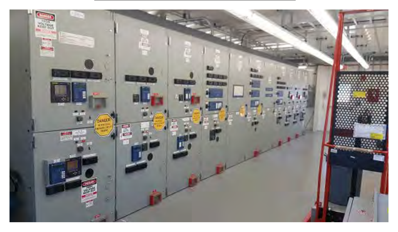
Figure 8B - Magnetic Signs Installed (front view)

Example of installed magnetic signs sized appropriately for the equipment