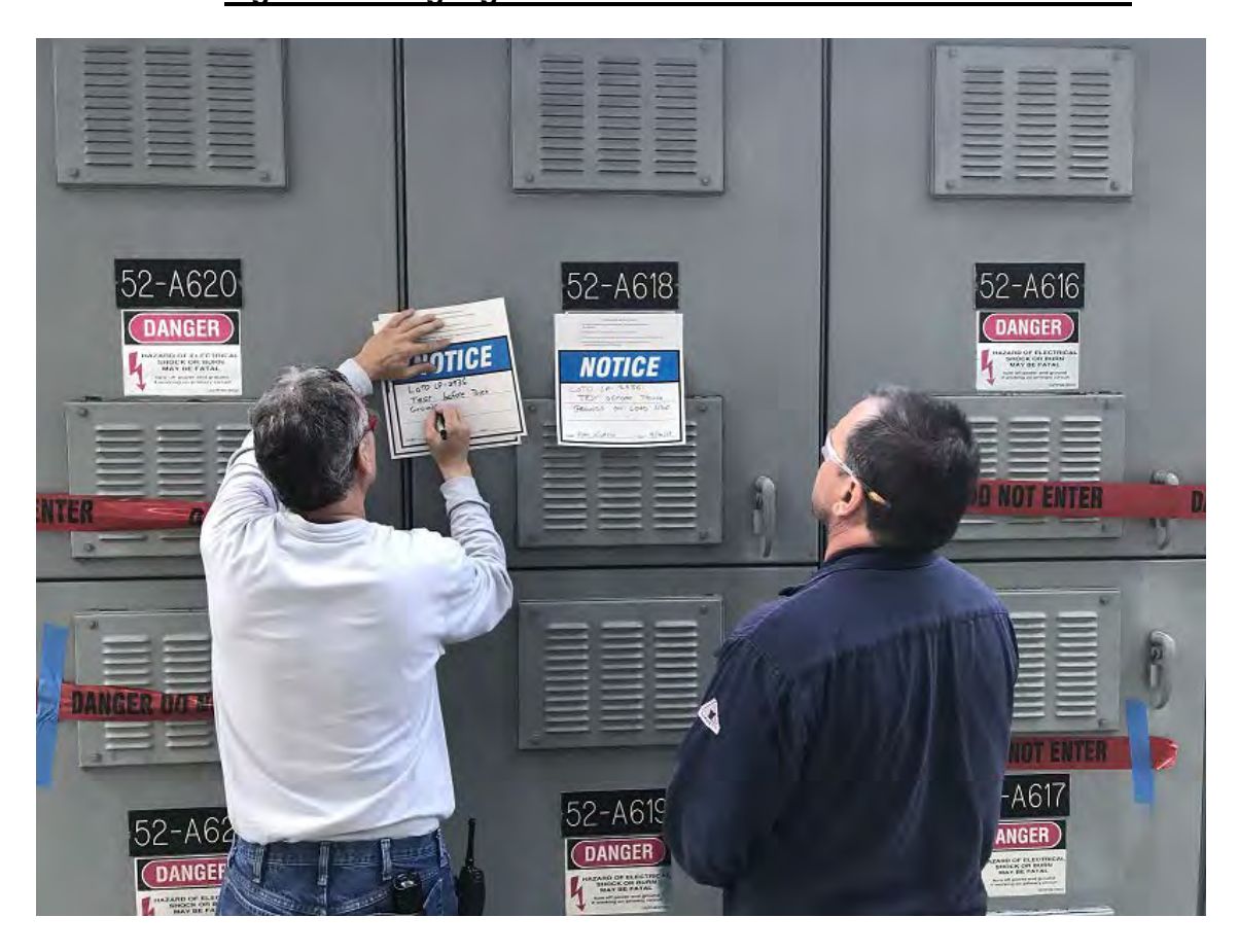
Figure 7B - Signage Installation on back of substation cubicles

Example of signs used in conjunction to indicate look-alike equipment and equipment status