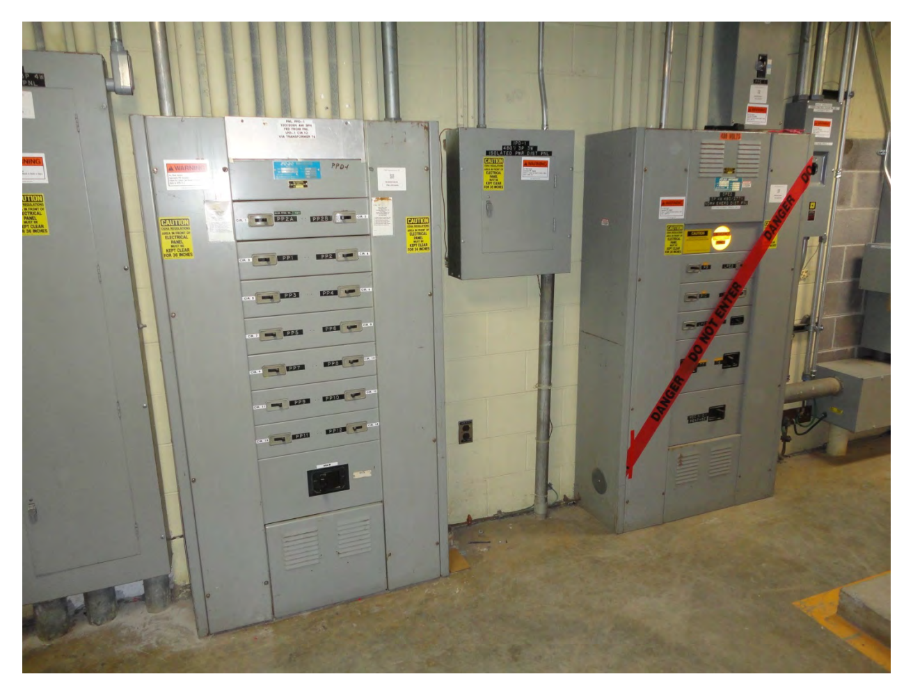
Figure 6 – Switchboards Prior to Maintenance on Switchboard on Left