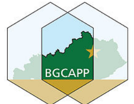
Blue Grass Chemical Agent-Destruction Pilot Plant